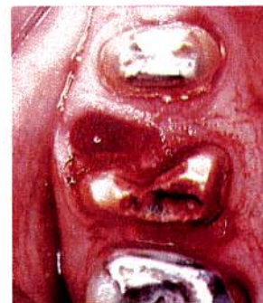
Fig. 4 — Definitive treatment with more extensive furcation invasion as seen in Figures 2 and 3 necessitates breaking through the buccal isthmus and removal of the resected single root. With the improved access, periodontal health can be more predictably maintained.

Thin bone is often accompanied by gingival recession which may result in easier access to the furcation.