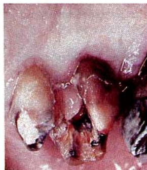
Fig. 3 — Palatal view of the same first molar (as seen in Figure 2) 8 weeks following the initial tooth preparation. In spite of the patient's best efforts, the palatal view shows hyperplastic tissue indicating that this extent of "barrelling" presents a situation that cannot be maintained.