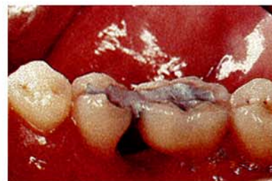
Fig. 13 — Fabrication of an intracoronal wire and amalgam splint will usually provide the patient with a "long term interim" restoration.