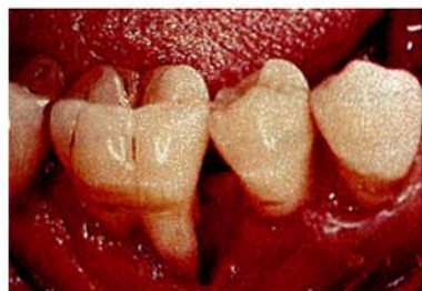
Fig. 11 — When hemisection in conjunction with a fixed bridge is not possible, an alternative approach may be root amputation (i.e. the clinical crown is left intact).

The principles of restoring a hemisected maxillary molar are similar to those as described with hemisected mandibular molars. The most common situation is when the mesio-buccal or disto-buccal root and overlying crown portion are removed (Figs. 3 & 4). Occasionally, a trifurcation is eliminated while all segments of the maxillary molar are maintained. This latter situation is similar to root separation (bicuspidization) of the mandibular molar. Orthodontic separation at times may be necessary as well as restoration via the use of individual telescopes in conjunction with an "overcasting".