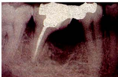
Fig. 12 — The periapical radiograph 4 months following the root amputation demonstrates significant osseous healing.