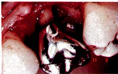
Fig. 6 – Although there is bone loss on the residual palatal and mesio-buccal roots, the anatomy of the full crown restoration allows improved access to the furcation area as compared to the crown in Figure 5.