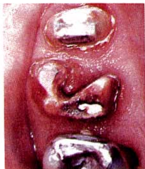
Fig. 2 — Occlusal view of the preparation that has eliminated an advanced Class II mesial furcation involvement. The same "barrelling" principle applies here as in the tooth treated in Figure 1. The extent of the "barrelling" must be limited by the accessibility of the "cul de sac" area to adequate oral physiotherapy.