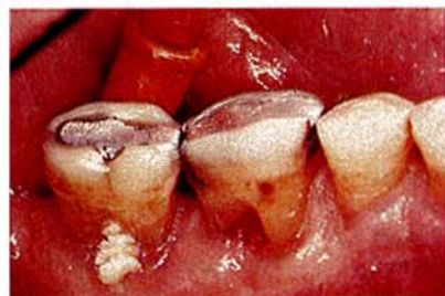
Fig. 8 — Where the roots of a mandibular molar diverge sufficiently, "tunnelling open" the furcation may at times be considered such that a proximal brush can pass through the furcation. Due to the tendency of developing root caries however, patients should first demonstrate an adequate level of oral hygiene.