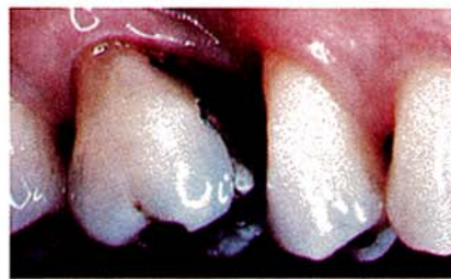
Fig. 7 – At times, a maxillary root amputation is carried out while the entire crown is left intact. Although this particular case is 5 years post-op with no apparent problems, a full crown restoration provides more protection against possible crown fracture.