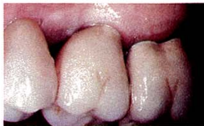
Fig. 5 – A mesio-buccal tri-section was carried out on the first molar. The crown anatomy incorporated into the final restoration demonstrates a common mistake in that there is insufficient access to the gingival third due to the overcontouring.

Class III furcations that are “tunnelled open” (Fig. 8) rather than resected may require a full crown restoration. Where possible, the crown margins should not extend onto the root surface. When it is necessary to cover the root surface however, it is best to recreate the original root contour while modifying the crown portion (as described for “tunnelled” Class III furcations).