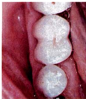
Fig. 1 — With early furcation involvement, the prosthetic preparation and restoration are "barrelled" in order to eliminate the roof of the furcation. The accentuated buccal and/or lingual grooves greatly facilitate oral physiotherapy in the furcation area.