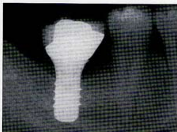
Fig 3 Periapical radiograph of an 8-mm-long wide-neck implant supporting a single posterior tooth, obtained 36 months following prosthetic restoration and 40 months after implantation.