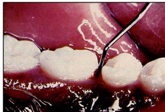
Fig. 6 — Localized juvenile periodontitis: With a careful examination including periodontal probing, what appears to be periodontal health (see Fig. 5) turns out to be localized advanced bone loss characteristic of juvenile periodontitis.