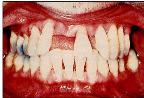
Fig. 4 — Advanced periodontitis: Certain patients exhibit advanced periodontitis without any obvious signs of clinical gingivitis. Sometimes this is because treatment may have only resolved the soft tissue lesion. In other cases, a minority of patients classified as very susceptible or downhill may continue to loose bone even though there seems to be minimal or no gingival inflammation.