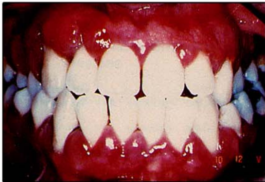
Fig. 3 — Advanced gingivitis and periodontitis: Untreated gingivitis usually will progress to attachment loss. In the absence of professional treatment and home care, there is often a concomitant gingivitis and periodontitis in the periodontally susceptible patient.