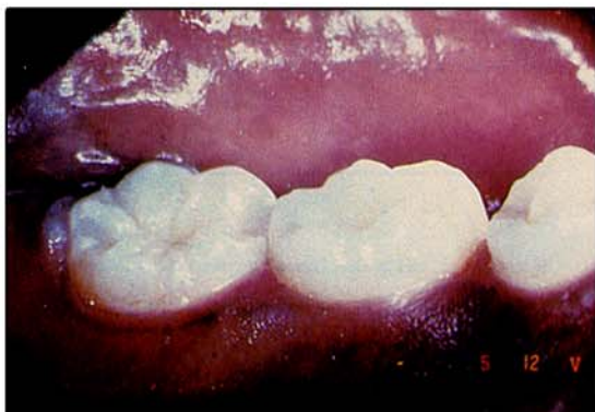
Fig. 5 — Apparent gingival health: From a visual examination alone, the clinician would suspect this periodontium to be healthy in this 14 year old black female (see Fig. 6).