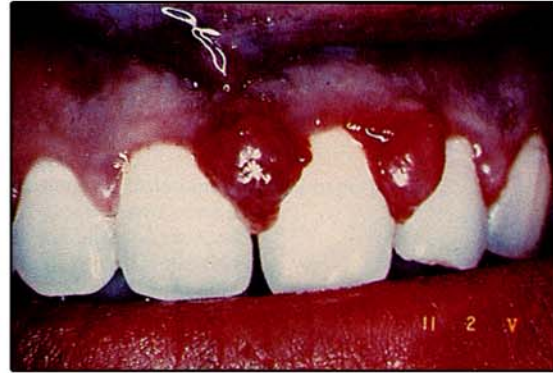
Fig. 2 — Pregnancy gingivitis: Hormonal changes during pregnancy may exaggerate the gingival inflammatory response due to an alteration in tissue metabolism. Clinically, the gingiva is usually fiery red with enlargement of the interdental papillae which bleeds easily and can be painful.