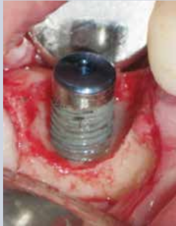
FIGURE 4B —Exposure of the 46 implant defect after debridement.