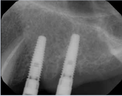
FIGURE 2A —Peri-implantitis affecting two implants at positions 24 and 25 extending 25 to 50 percent of the length of both implants. The bone is thin oral-facially and the defects have only 2-walls.