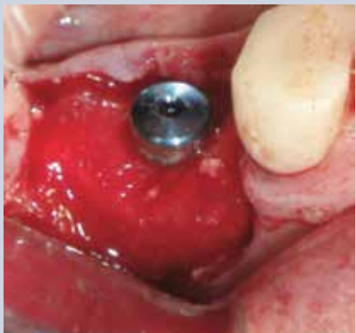
FIGURE 4G —A resorbable membrane is placed around the implant and over the bone graft.