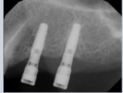
FIGURE 2C —Six month post-operative radiograph demonstrating a combination of crestal bone loss and regeneration of the apical component of the defect. Crestal bone loss is more common when lacking good regeneration conditions.

see in periodontitis. 5,6 But most importantly to clinicians, the diseases do not respond to treatment similarly.