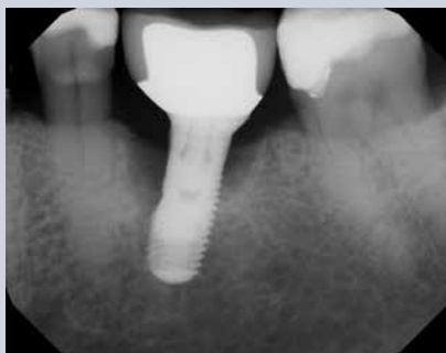
FIGURE 1B —Radiograph after implantoplasty procedure. The threads on the distal of the implant are engaged in sound lingual bone and not removed.