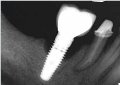
FIGURE 4A —Peri-implantitis affecting the implant at position 46.