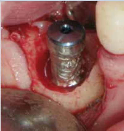
FIGURE 4D —Clinical image of the 46 implant after implantoplasty.