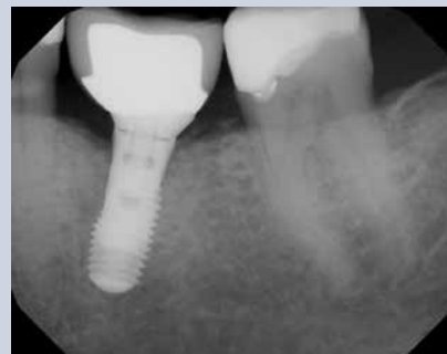
FIGURE 1C —Six month post-operative radiograph demonstrating nearly complete regeneration of the defect.