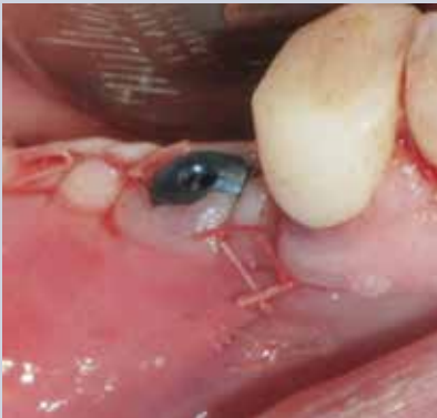
FIGURE 4H —Post-operative image after flap closure and suturing.