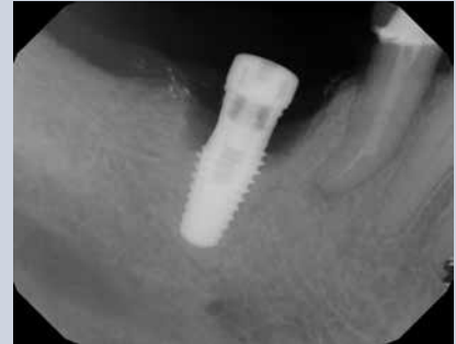
FIGURE 4C —Radiograph of the 46 implant after implantoplasty.