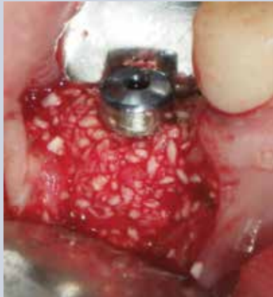
FIGURE 4E —An allograft bone particulate placed into the defect site.