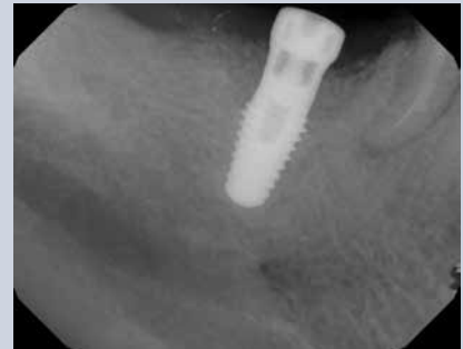
FIGURE 4F —Radiograph of the 46 implant after implantoplasty with bone graft in place.