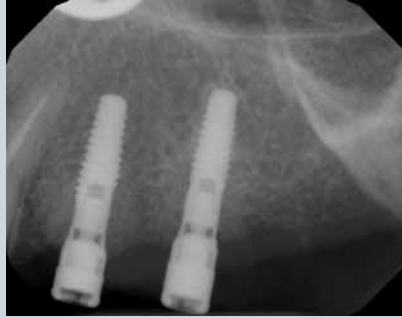
FIGURE 2B —Post-operative radiograph after implantoplasty and guided bone regeneration.