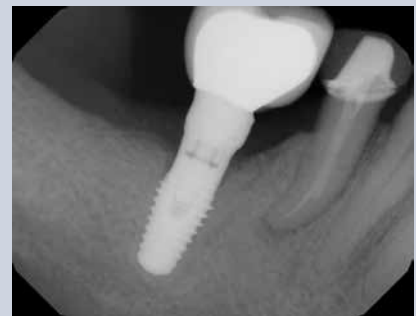
FIGURE 4I —Six month post-operative radiograph with reattachment of the original crown. Partial bone regeneration of the lesion is demonstrated.

cal treatment to be effective over two years, resulting in cessation of peri-implant bone loss and a reduction of bleeding on probing from 80 percent to 34 percent. 12 Froum et al. (2012) also