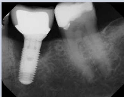
FIGURE 1A —Peri-implantitis affecting an implant at position 36.

many features. Both diseases can be initiated with periodontal pathogens and both have similar clinical presentations, including deep probing depths and bleeding. Even the microbiology cultivated from both are similar. 5,27 But histologically and pathologically the diseases vary. The microbiology of peri-implantitis is more diverse than that of periodontitis, with lower levels of red complex species. 26 Histologically, peri-implantitis is much more infiltrative near the alveolar crest and often lacks a protective layer of tissue over the bone as we typically